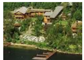
Who's Home is this?

"I want to thank you, our members, in advance for your continued support, attendance and participation in our Local Chapter. "